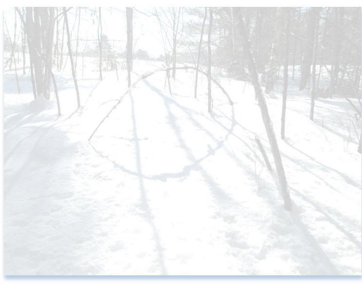
Cover Photo © 2014 Donna Wentworth